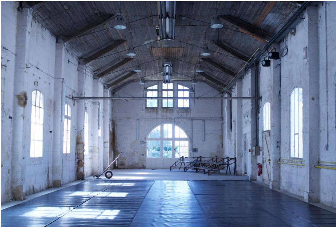
Studio space at Les Moulins de Paillard