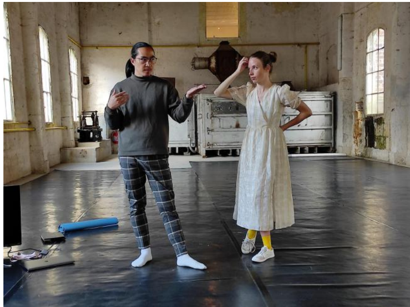
Discussion with the public

On the 28th, I had a public presentation in which I shared my discoveries. The first part consisted of showing the material created with a performance and a screening, the second was to engage in a discussion with the public. We talked about the research content and audience members shared their personal experiences relating to the subject treated.