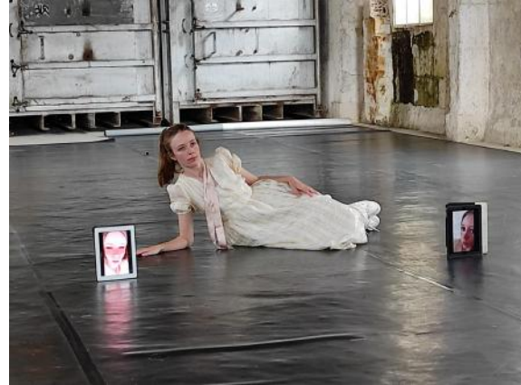
Working with video and screens