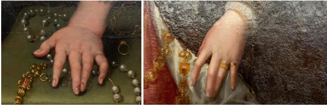
Details of paintings from Palazzo Mansi

During the second week and a half I brought all ideas together and physically remembered the movements and improvisations I had developed at Les Moulins de Paillard. I also worked with objects such as eggs, a long ponytail, etc. linked to a certain idea of femininity. Those are objects with which I interact with but that will also be part of the scenography.