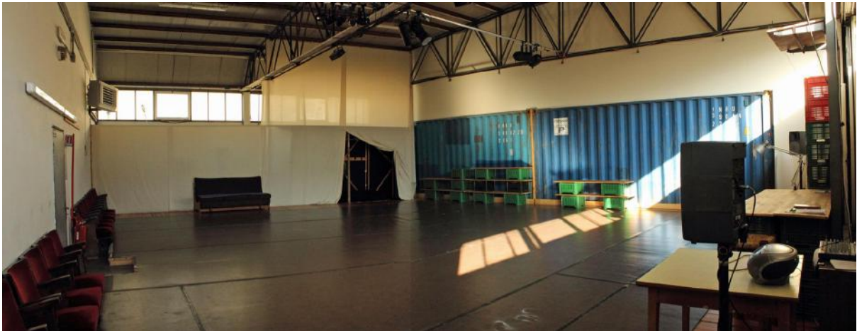
SPAM!'s dance studio