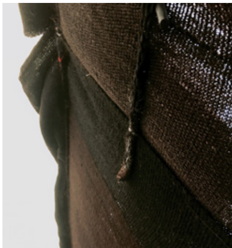
tent made of Yakwool