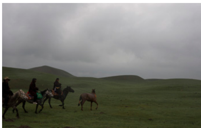
Horsemen on their way home

After two flights and a long drive by car, I reached the rolling Grasslands of Tibet . The mountains on the plateau are old and impressive, the light hits the tops and gently rolls over the plains, the hills, towards the sharper edged mountains. The environment is beautiful and harsh at the same time. Winters hit below -15 and the sun burns strong rays. The nomads however can survive in such a harsh climate and live off their cattle.