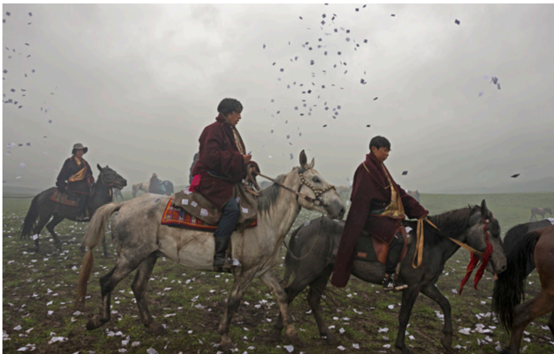
Horse man during festival

After 2 week when I had shot most of my material and lived amongst them for long enough to know who to talk to, I dared the nomads to make a textile based on the photographs I had been taken of their landscape.